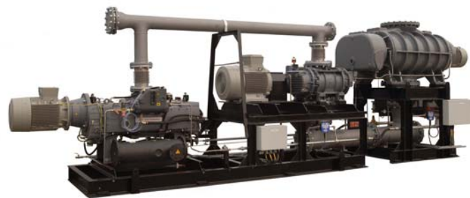
Fig. 2. Three-stage, dry mechanical vacuum pump module for steel degassing

The resulting steel degassing module is illustrated in Fig. 2. It is optimised for efficiency, performance and simplicity, and represents a refined and highly effective approach to providing the required vacuum pumping speed to the vacuum degassing process. In addition to the practicality of having a compact, space-saving module which is delivered fully piped, wired and instrumented, and which only needs to be mounted in place and connected to the process inlet manifold, exhaust manifold and utilities, the modular concept also gives significant flexibility. This is because a suitable number of modules can be installed in parallel to provide a specific pumping capacity for current requirements, and then increased pumping capacity can easily be provided later if heat sizes are to be increased by mounting additional modules in parallel.